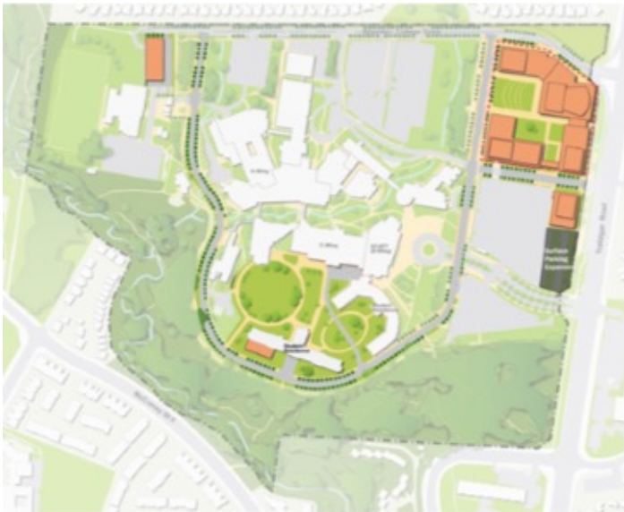
Short Term Plan (0-15 yrs)