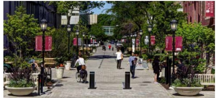
8. Prioritize active transportation on campus (University of Chicago)