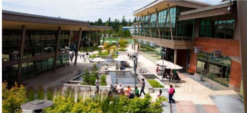
5. Enhance existing open spaces to encourage health and wellness on campus (Microsoft Campus - Bellevue WA)