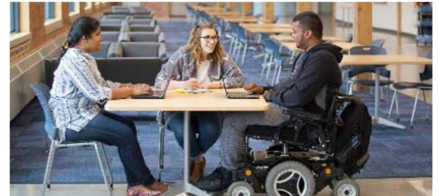
4. Create an accessible internal circulation system with a relationship to the outdoors (Ontario Tech University - Oshawa ON)