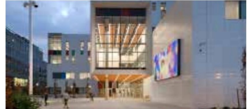
2. Seek opportunities to create a strong sense of arrival along Trafalgar Road, explore partnership opportunities and reinforce Sheridan's unique academic brand to the larger community (Emily Carr University - Vancouver BC)