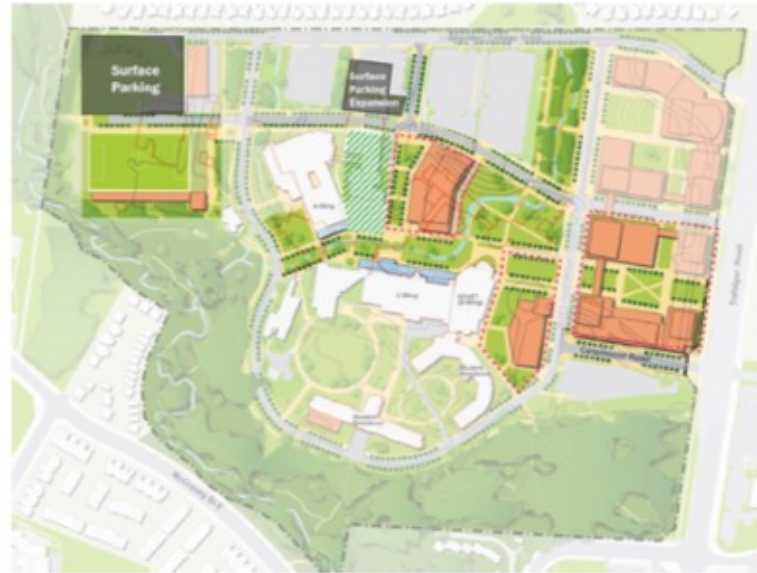
Medium Term Plan (15-25 yrs)