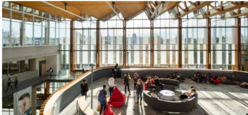
3. Build flexible student life hubs that foster collaboration and inclusion (University of British Columbia Student Next - Vancouver)