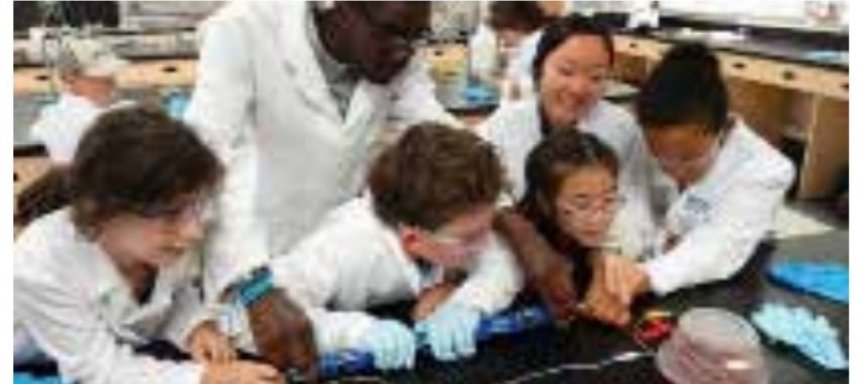
6. Seek opportunities to reinforce Sheridan's relevance to the community through engagement and academic programming