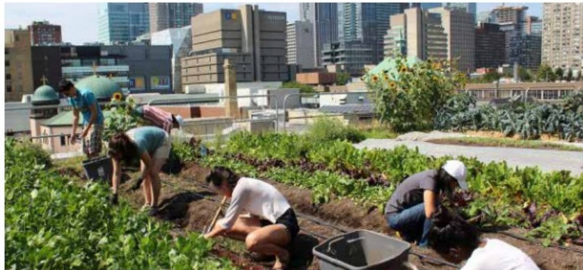
7. Continue to lead with best practices in sustainability (Ryerson University - Toronto ON)