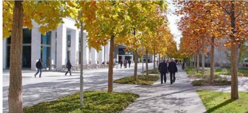
1. Reinforce a clear, efficient network of streets and blocks that can be logically phased (Novartis Campus - Basel, Switzerland)

The campus design principles were developed to respond to the physical issues and opportunities of the campus today. The principles guide the vision for change at Trafalgar Campus and inform the content of the Master Plan.