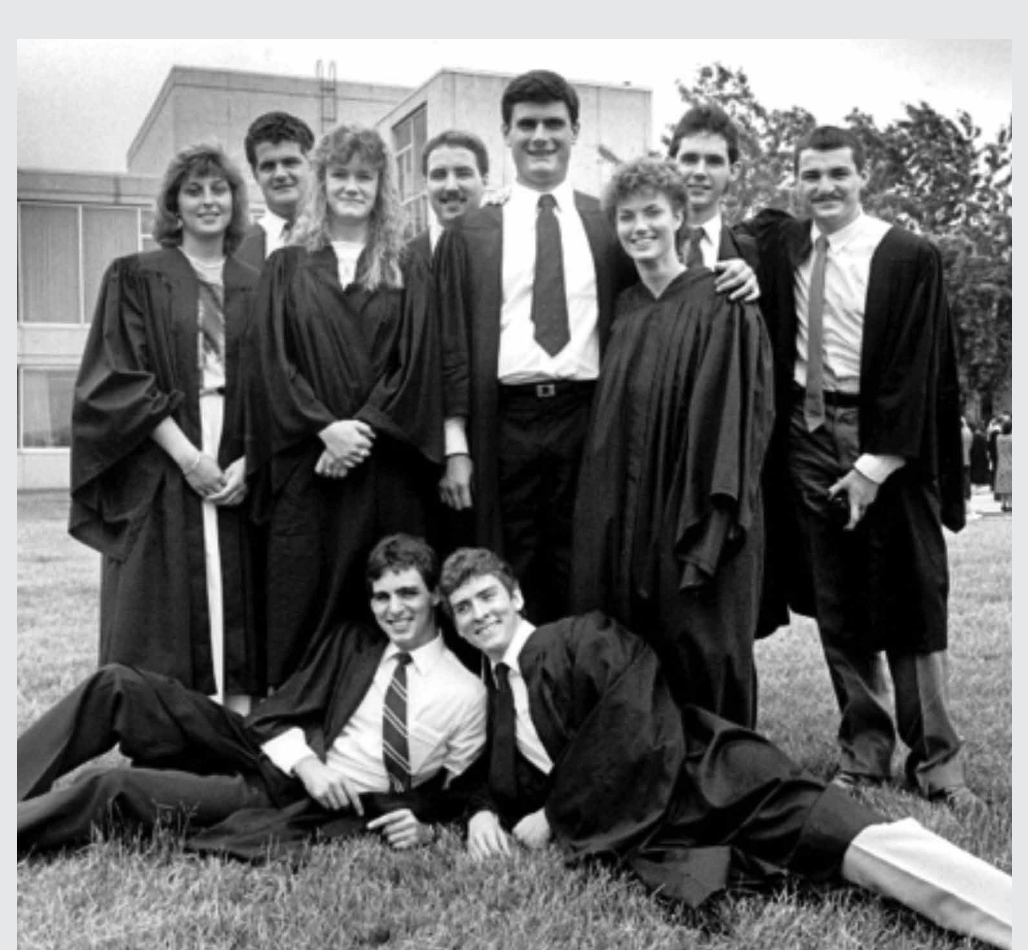
Brampton Graduation | 1987