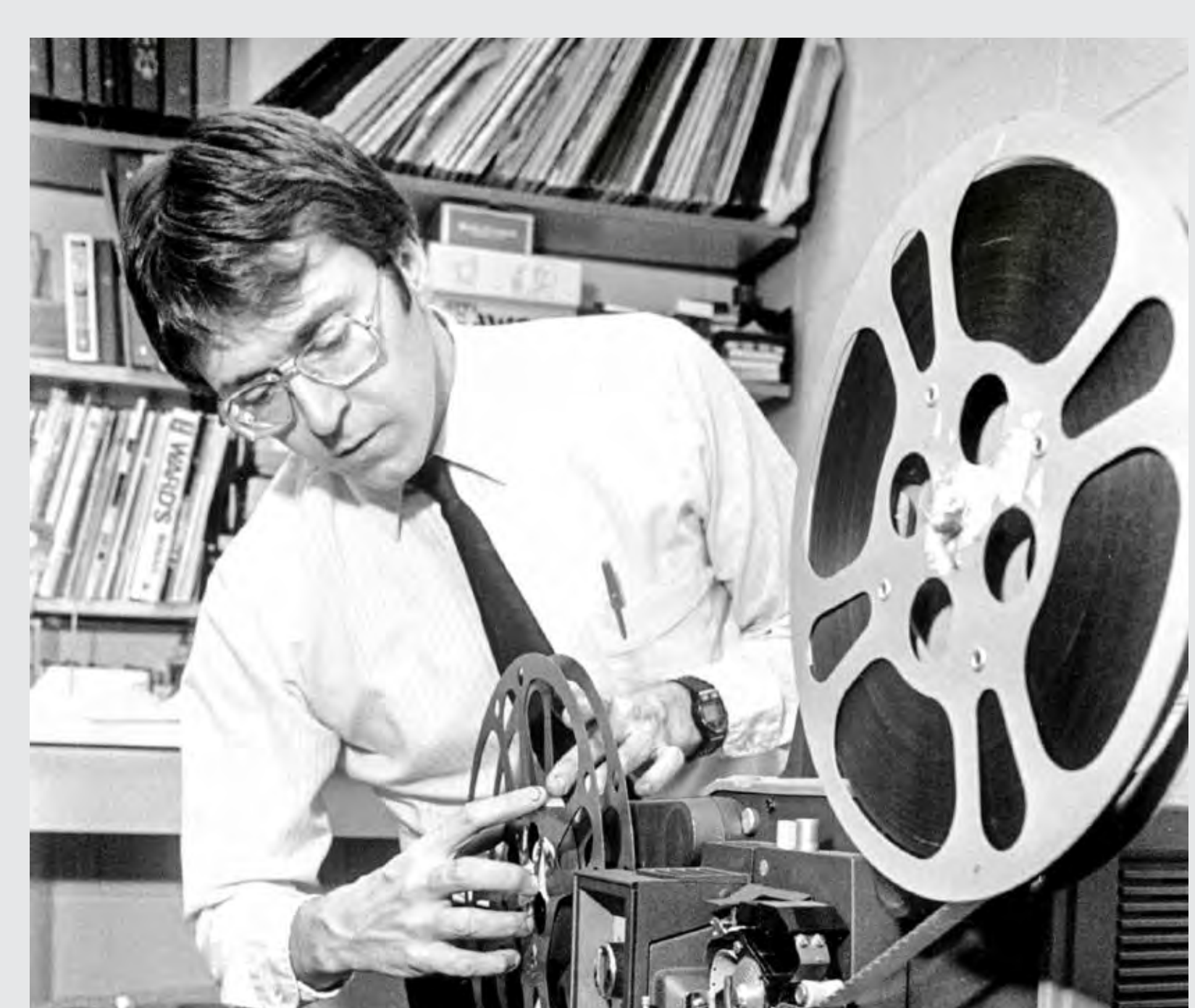
Sheridan Stock Footage | 1980s

Student-produced films by Sheridan's Media Arts department were featured at a screening at Canada House in London, England.