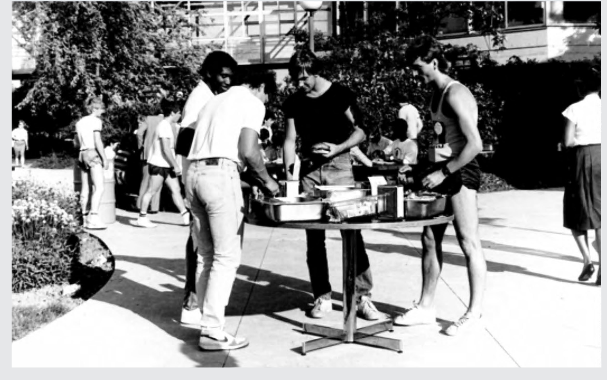
Brampton Campus Orientation | 1985

"It's really bad this year. The college should add an expansion to the school for more classrooms."