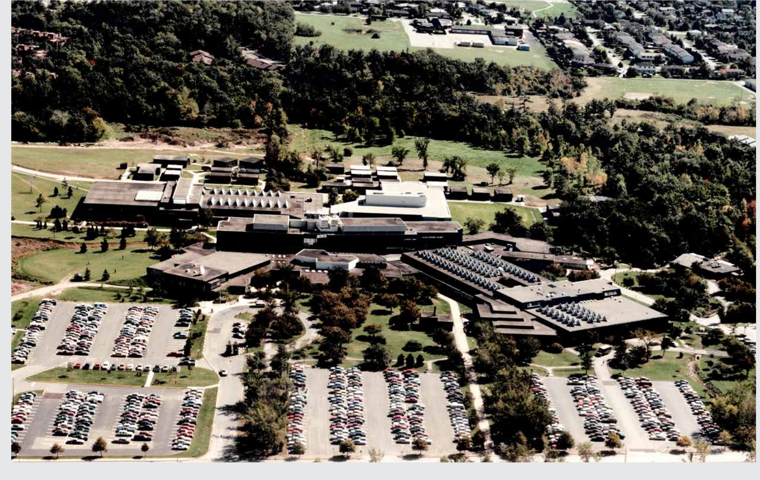
Trafalgar Campus in the 1980s