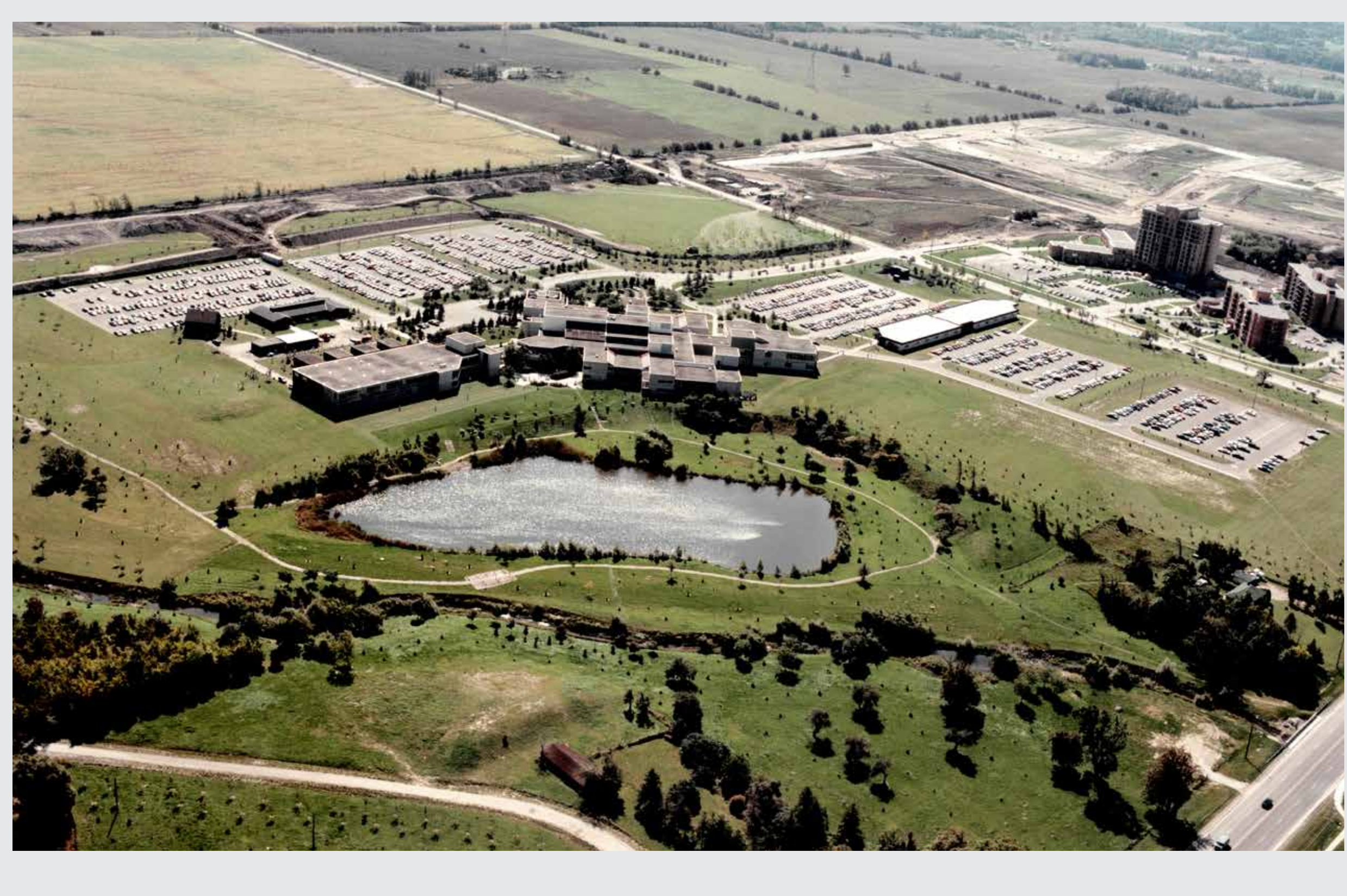
Brampton Campus in the 1980s