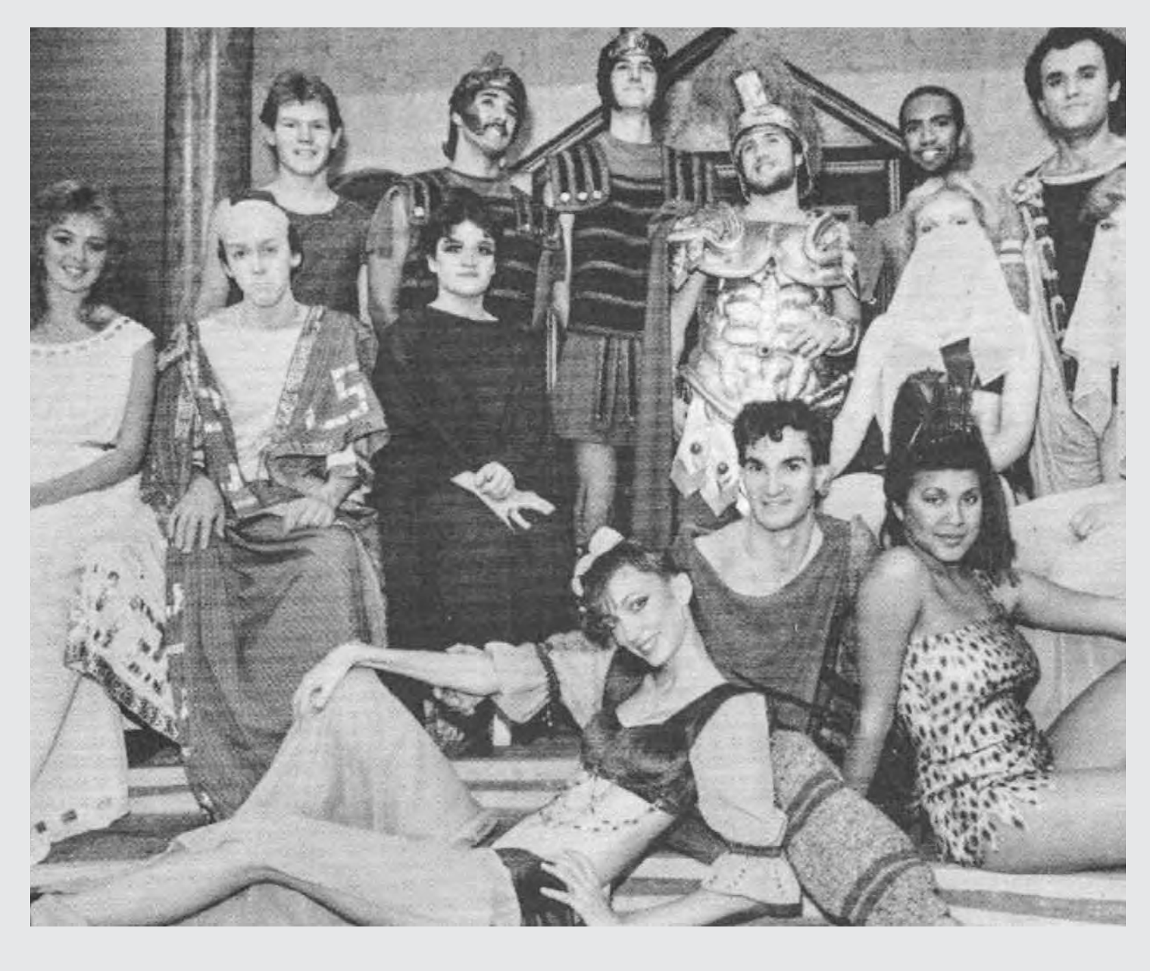
Theatre Sheridan's 1984 performance of A Funny Thing Happened on the Way to the Forum

With high unemployment and a sputtering economy, many Ontarians were forced to seek new career directions through Sheridan's Continuing Education department. 35,000 Halton and Peel residents enrolled in 2,000 Continuing Education courses. These students had an average age of 35 to 45. The next year, the number of parttime students rose by 20 per cent – Sheridan's largest increase ever.